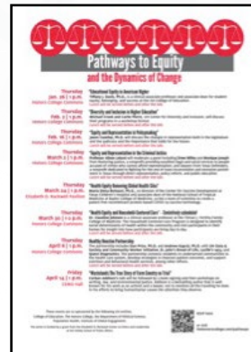
Pathways to Equity and the Dynamics of Change Speaker Series, co-sponsored by Political Science