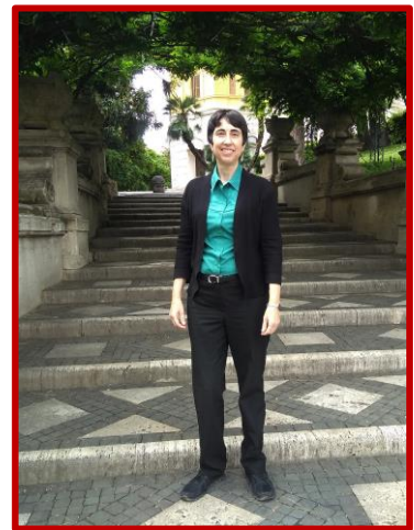
(This is me while serving as Scholar-in-Residence at LUISS-Guido Carli in Rome in May, 2018)