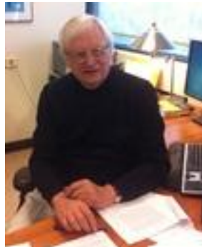
Professor Kent Tedin

In an experiment, respondents are randomly assigned to a variety of different treatments, along with a control group, which makes it possible to test any number of hypotheses. The advent of Internet surveys has made experiments in